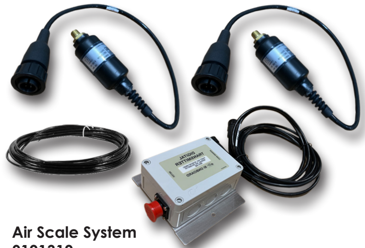
Air Scale System 9101310