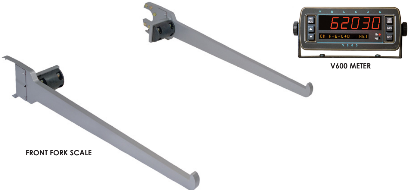
FRONT FORK SCALE

Our Fork Scale fits all types of front loaders in refuse applications. The rugged bolt-on weight sensing forks replace the truck's existing forks. Working in conjunction with the Vulcan V600 electronics, the system measures the weight collected from each container and tracks the total net payload weight. The V600 meter offers data acquisition and expansion capabilities.